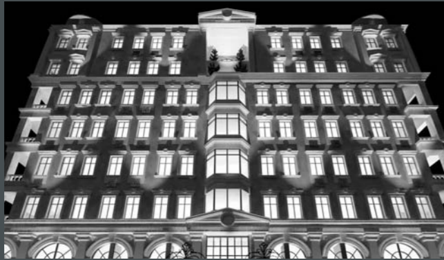
The Versailles at night