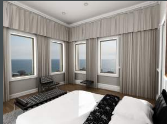
Your spacious bedroom and bathroom