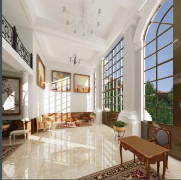
The Versailles lobby