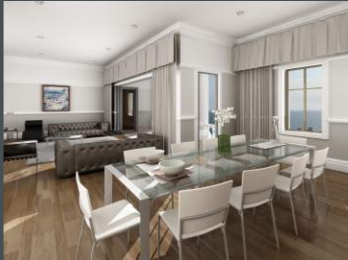
Your lounge and living room

High ceilings, large balconies, spacious rooms, exclusive access. These are the qualities that define luxury and style.