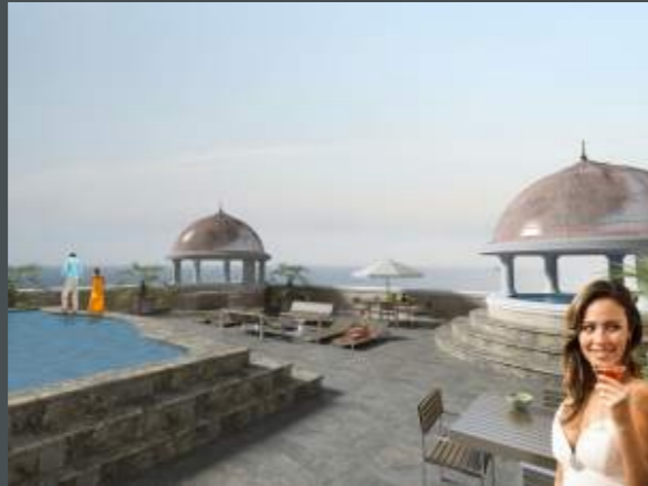
Your rooftop pool, sundeck and jacuzzi

A rooftop swimming pools, sundeck and jacuzzi tops out each penthouse. The views of the ocean and the mountain are unobscured will take your breath away.